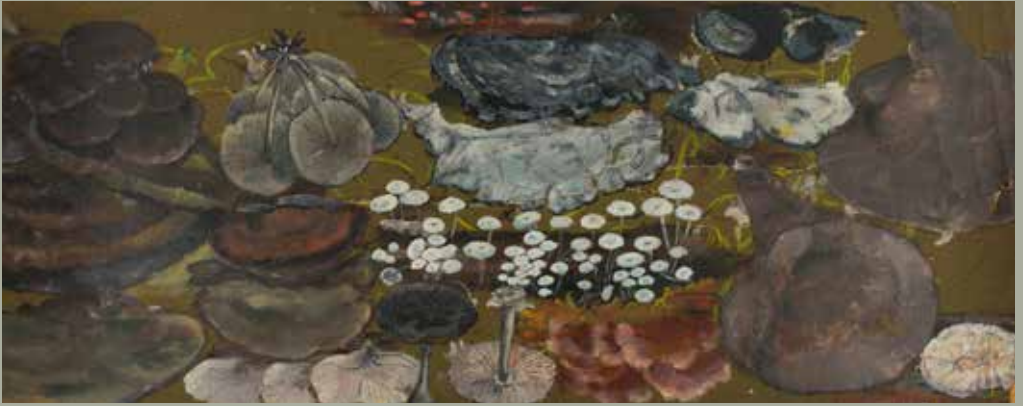
Image credit: Fanny B. Good, N.Z. Fungi , collection of Puke Ariki